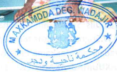
Xaliimo Maxamed Calasoww