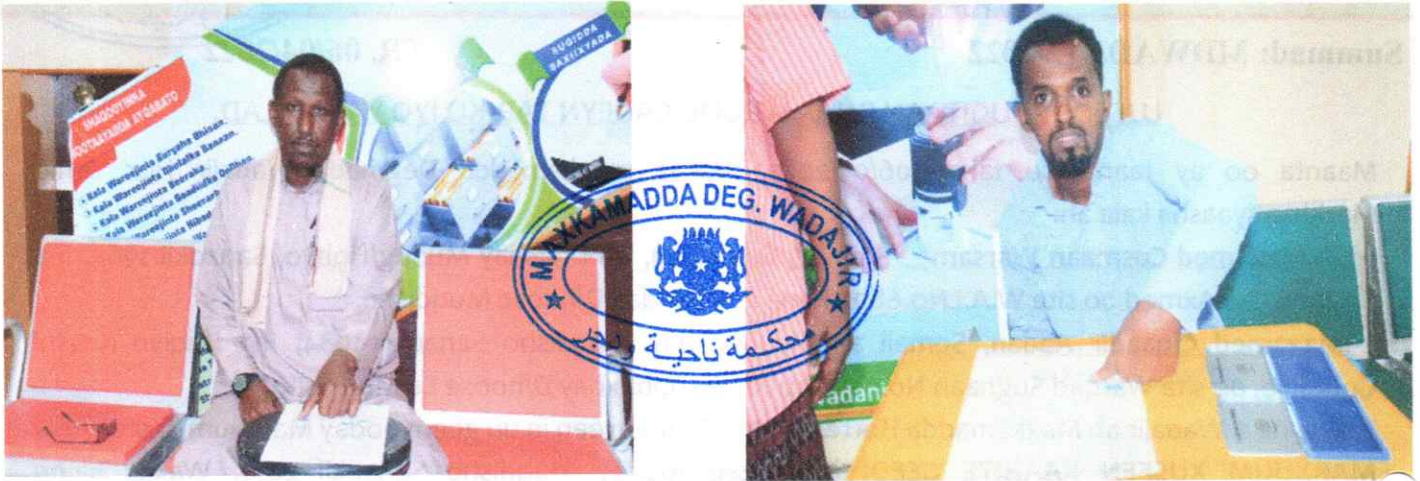
2- Maxamed C/qaadir Aadan