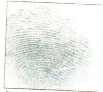
Right Thumb Print