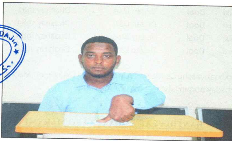
Ismaacil Biixi Dool