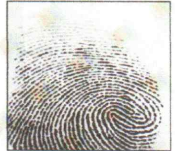
Right Thumb Print.