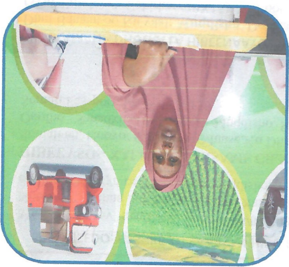
NIMCO CALI HILOWLE