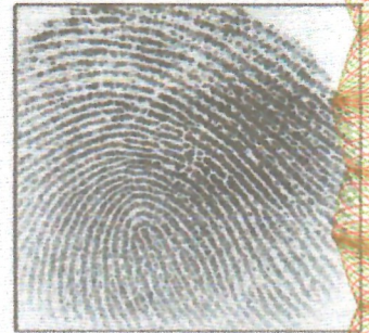
Right Thumb Print