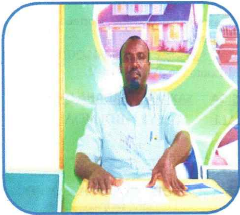
MARAG:C/QAADIR XAAJI MAX'ED