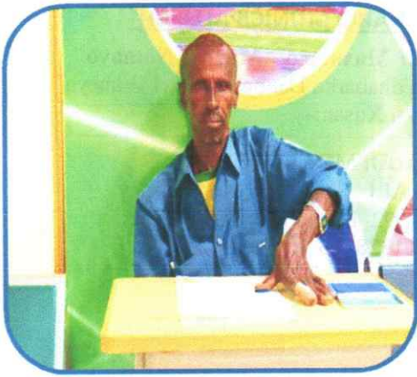
DAMIIN/C/NUUR MAX'ED CALI