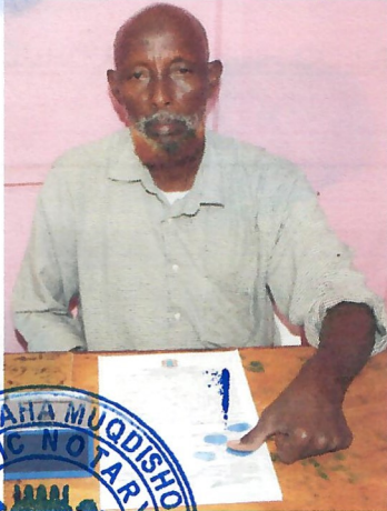
Masawirka markhaatiga 1aad

Beec R: 931/T.P.N/23 Tr: 26/12/2023 20X15-m L: 1467-w