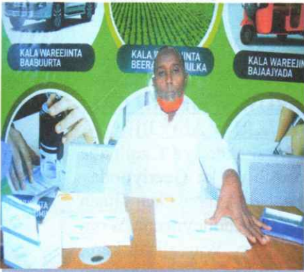
Axmed Jirow Sharmarke