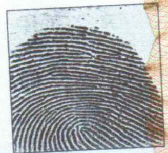
Right Thumb Print