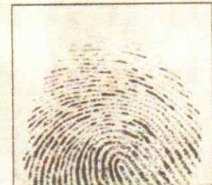
Right Thumb Print