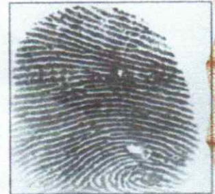
Right Thumb Print