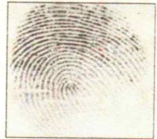
Right Thumb Print.