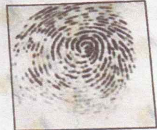
Right Thumb Print.