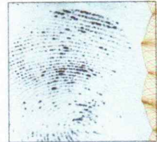
Right Thumb Print