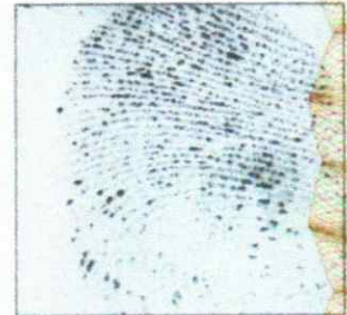
Right Thumb Print