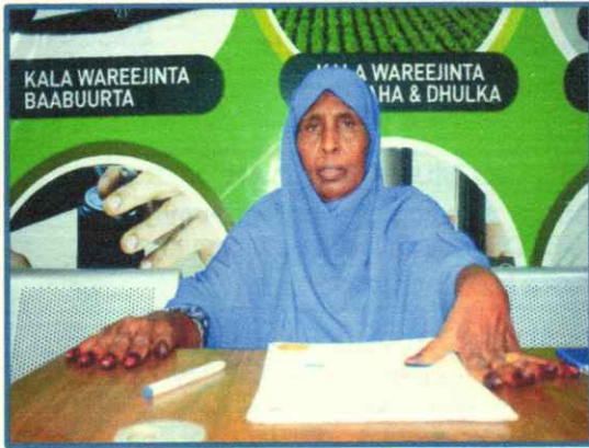
CADAR KHALIIF BAALLE CILMI