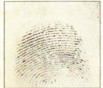
Right Thumb Print

Duqa Magaalada ee Muqdisho Mayor of Mogadishu