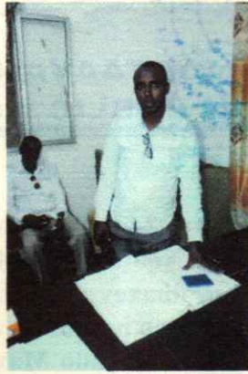
Wakiil u saxiixe