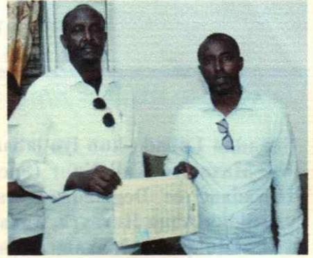
iskagade iyo Wakiil u saxiixe