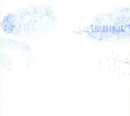
2-C/LAAHI KHALIIF MAXAMED