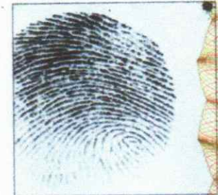
Right Thumb Print