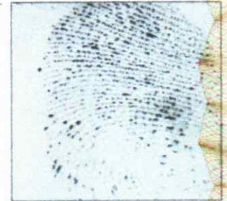
Right Thumb Print