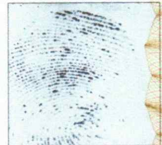
Right Thumb Print