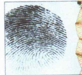
Right Thumb Print