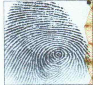
Right Thumb Print