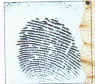
Right Thumb Print