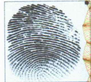
Right Thumb Print