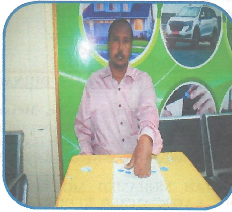
MASAWIRKA DARAFKA 3'AAD